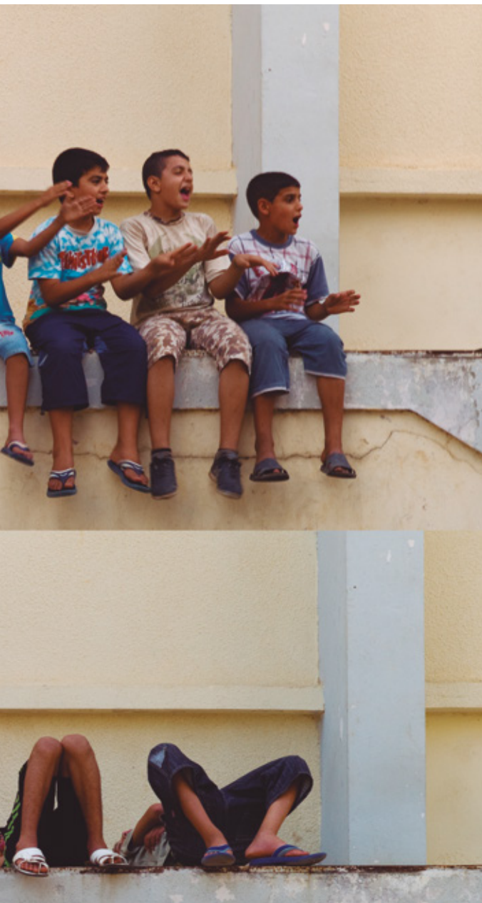
Kids playing and resting in UNRWA Training Centre in Siblin, Lebanon.

Based on this framework, this publication provides a broad description and analysis of the challenges and opportunities for the implementation of the SDGs by LRGs in the MEWA region. The first part of the publication describes the engagement with the SDG agenda at the national level, the participation of LRGs and the institutional context for SDG implementation, including recent trends regarding (de)centralization and the governance frameworks of LRGs, particularly as regards decision-making. The second part of the regional report focuses on the specific efforts of LRGs across the region to contribute to the SDGs, as well as those of local civil society and those supported by external actors. The analysis takes a comprehensive view of these initiatives, considering not only those explicitly identified with the SDGs, but also efforts whose outcomes are directly related to the SDGs, even if no explicit linkage to the framework is established in their formulation. The last section presents a set of conclusions and policy recommendations for both the MEWA region and the global sphere. ○