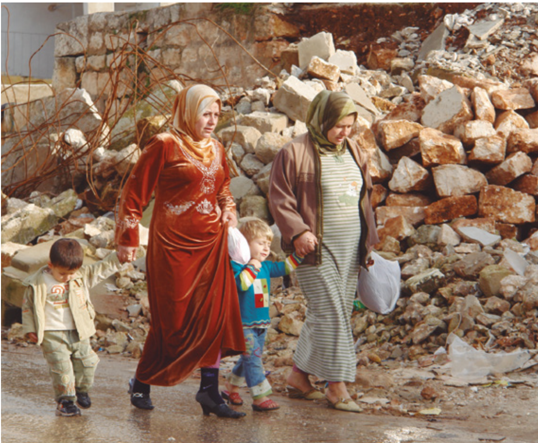
Women walking with kids, Syria (photo: Charles Roffey, bit.ly/2MsZR6v ).

Lack of financial autonomy, transparency and alternative options have curbed the capacity of MEWA LRGs to fund themselves, their activities and — inevitably — also their mobilization for the SDGs. In fact, the extensive reliance on short-term funds has led to a general financial weakness, and many national governments in the region have used this to leverage more municipal amalgamation. In Jordan alone, over 300 municipalities were joined into 93 municipalities. 60 In 2014, Turkey amalgamated 2,950 municipalities into 1,398. 🕒