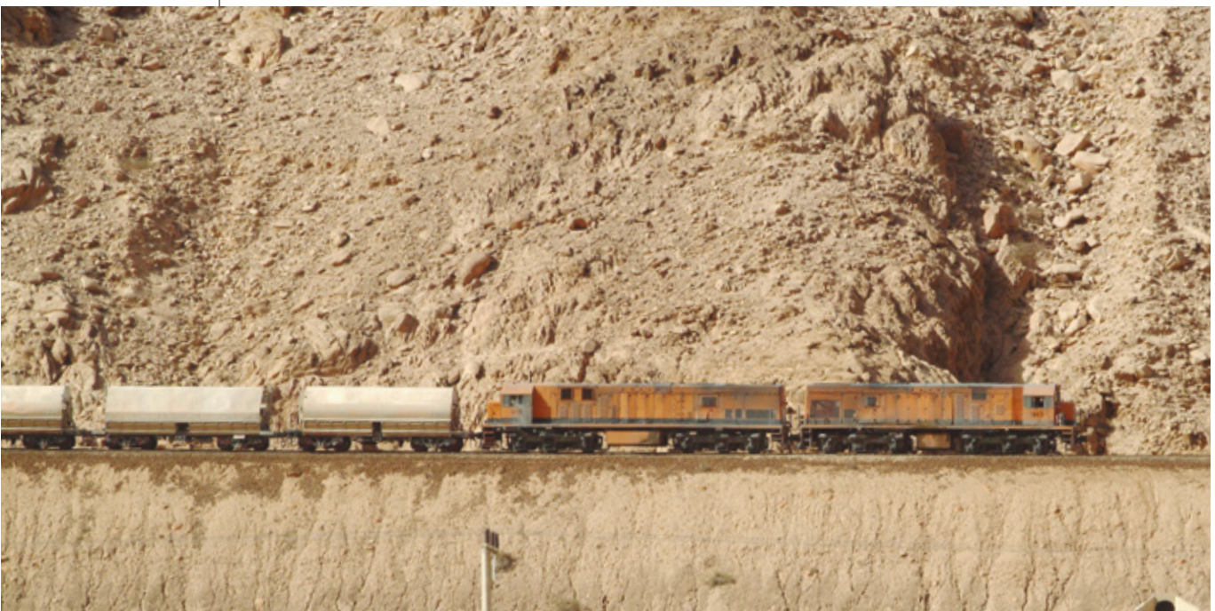
Phosphate train on its way to Aqaba, Jordan.

In Iraq , for example, governorate councils have extensive power over lower local councils in the implementation of local projects: at the administrative level, more generally, mayors need the approval of governors for any activities within