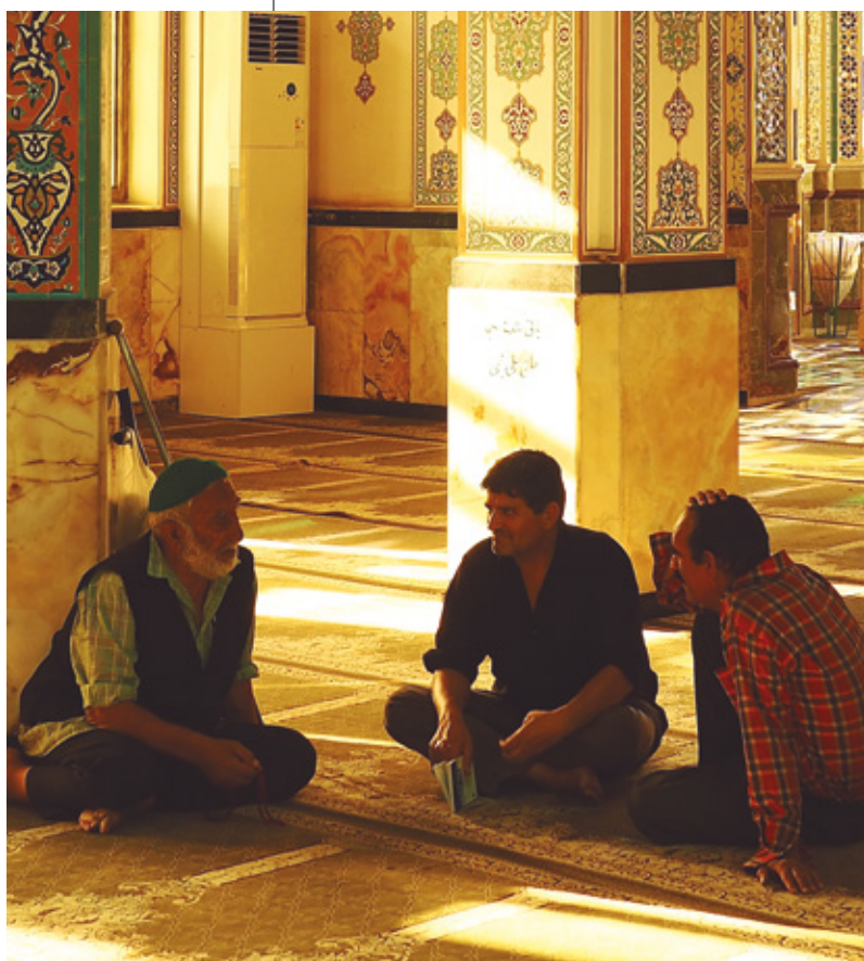
Men chat in shrine near Kashan, Iran (photo: Charles Roffey, bit.ly/80zbB).