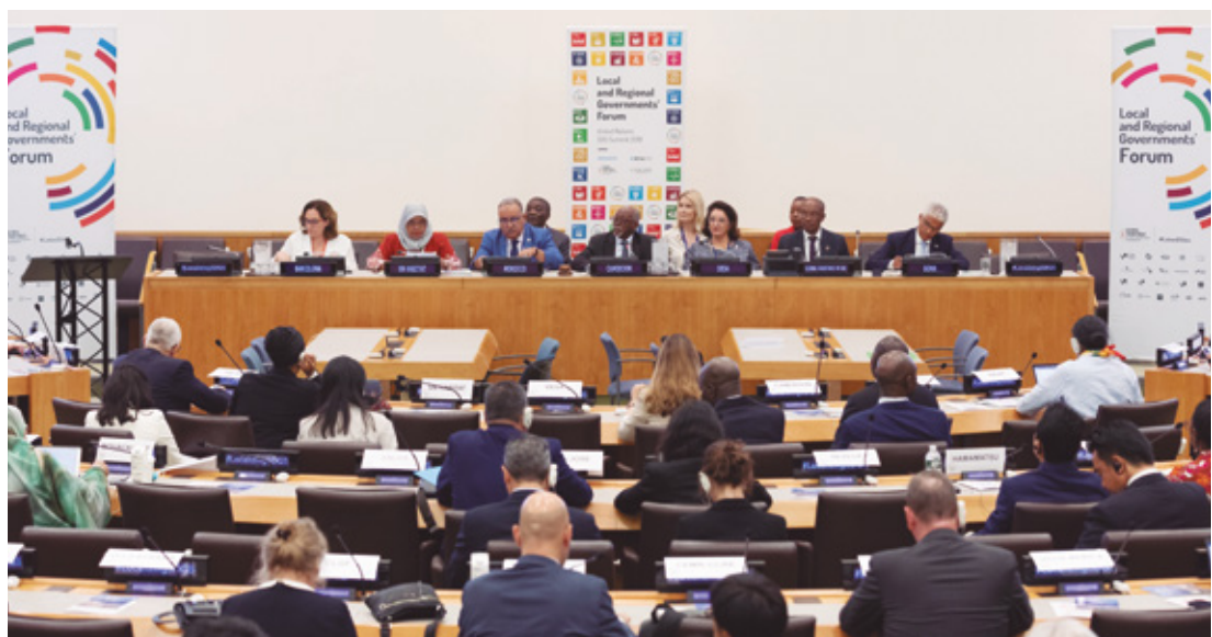
The Local and Regional Governments' Forum, organized by the Global Taskforce, during the United Nations' SDG Summit in New York on September 24, 2019.

In the face of such challenges, it is imperative that we scale up and accelerate action before it is too late. In order to do so, we need to think differently about development strategies and adopt an evidence-based approach to sustainable development that reflects the reality of today's world. Urbanization, the development of frontier technologies and connectivity are some of the defining features of our contemporary societies, and although they pose challenges to governance, they are also the key to achieving the SDGs and preserving life for future generations. 🌐