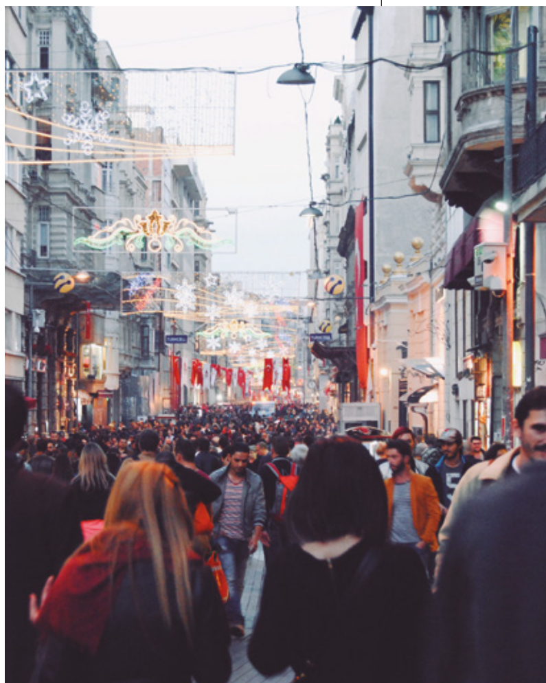
Crowd in Istiklal Caddesi, Istanbul, Turkey.

While the discovery of oil in the 20 th century gave Iraq and Iran substantial wealth that allowed them to develop an industrial base, the economic base in Afghanistan, Jordan, Lebanon, Palestine, Syria and Yemen has been unable to keep up with population growth, and urban unemployment has generally risen. In some countries, Jordan and Palestine in particular, the remittances of expatriate workers in Gulf states and Western