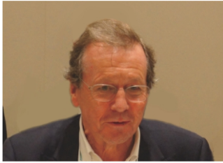
George Ferguson Mayor of Bristol

Bristol is about 170 kilometers west of London. The city has half a million population, so this is a small city in Chinese terms. It is a complex historic city, so it is a city you cannot start from scratch. You work with what you've got. It has a lot of blue and green as you can see in the city.