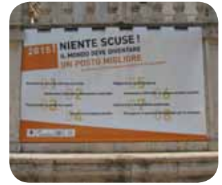
MDGs Campaign: Paris - Buenos Aires - Rome