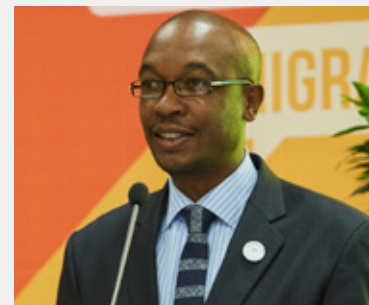
Parks Tau President of UCLG

Participants agreed on the key elements of a proposal for the development of the Local4Action Hub, which will be the focus of the strategic partnership to be developed with the Swedish Development Agency, SIDA.