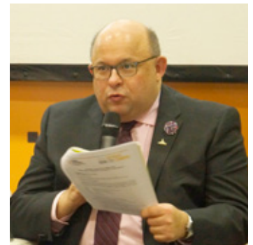
Berry Vrbanovic Mayor of Kitchener and Treasurer of UCLG

We developed a common plan where the national government was responsible for integration, the provincial government for education, and local government supported these new Canadians to arrive in the communities.